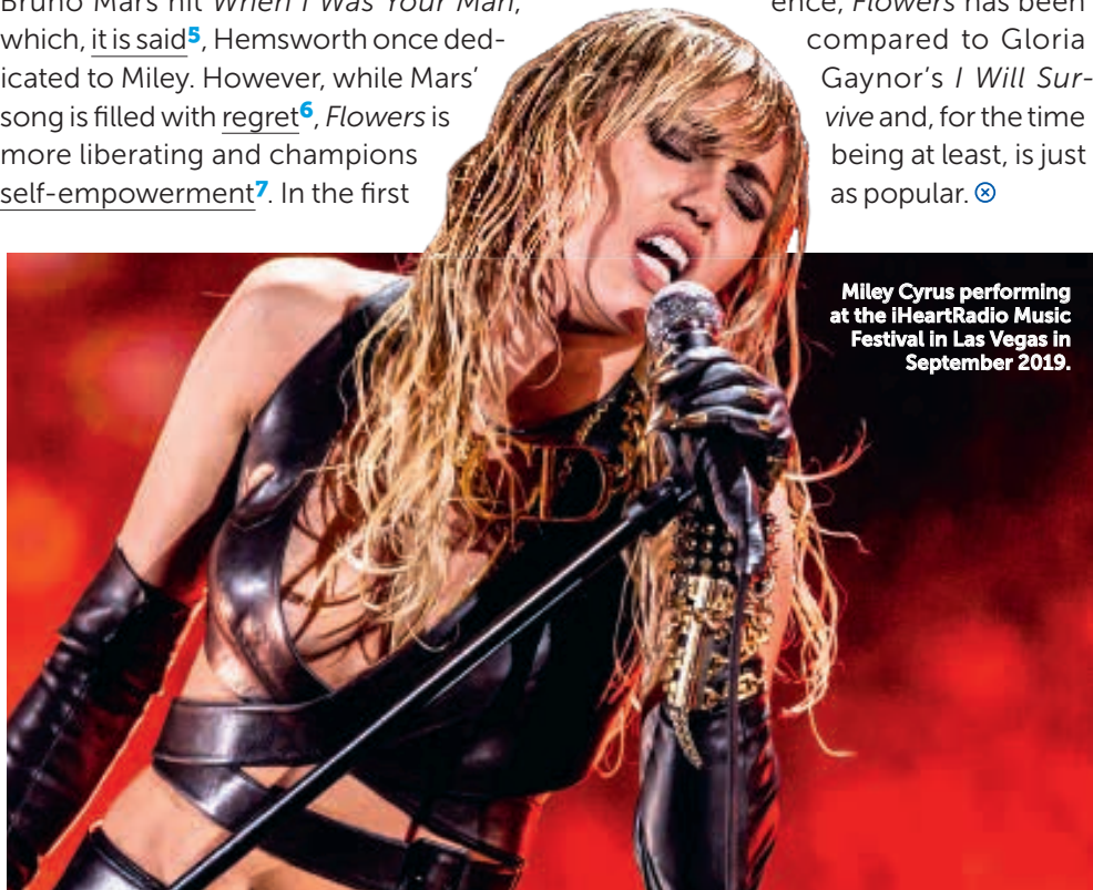
Miley Cyrus performing at the iHeartRadio Music Festival in Las Vegas in September 2019.

Kinda: an informal contraction of 'kind of'.